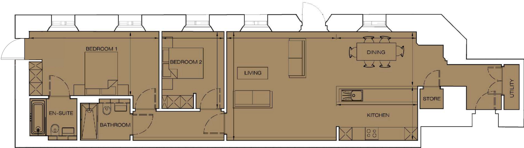
FLAT B27 - GARDEN FLOOR PLAN