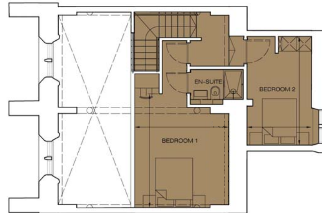
FLAT G09 - MEZZANINE FLOOR PLAN