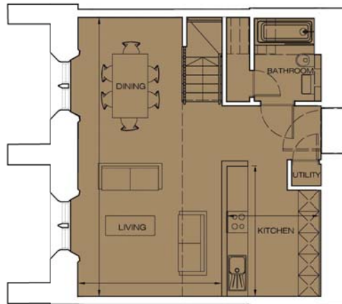
FLAT G09 - GROUND FLOOR PLAN