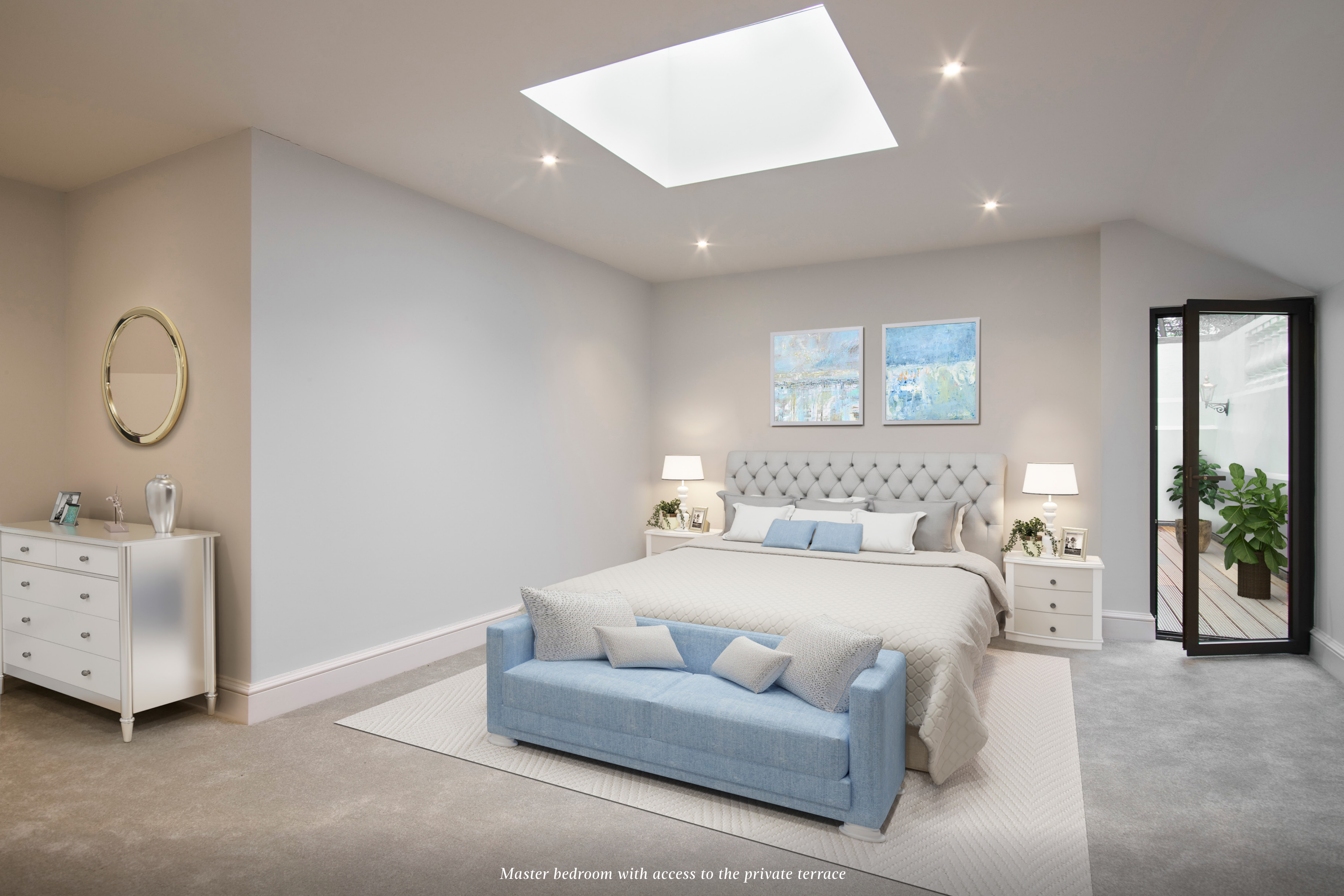
Master bedroom with access to the private terrace