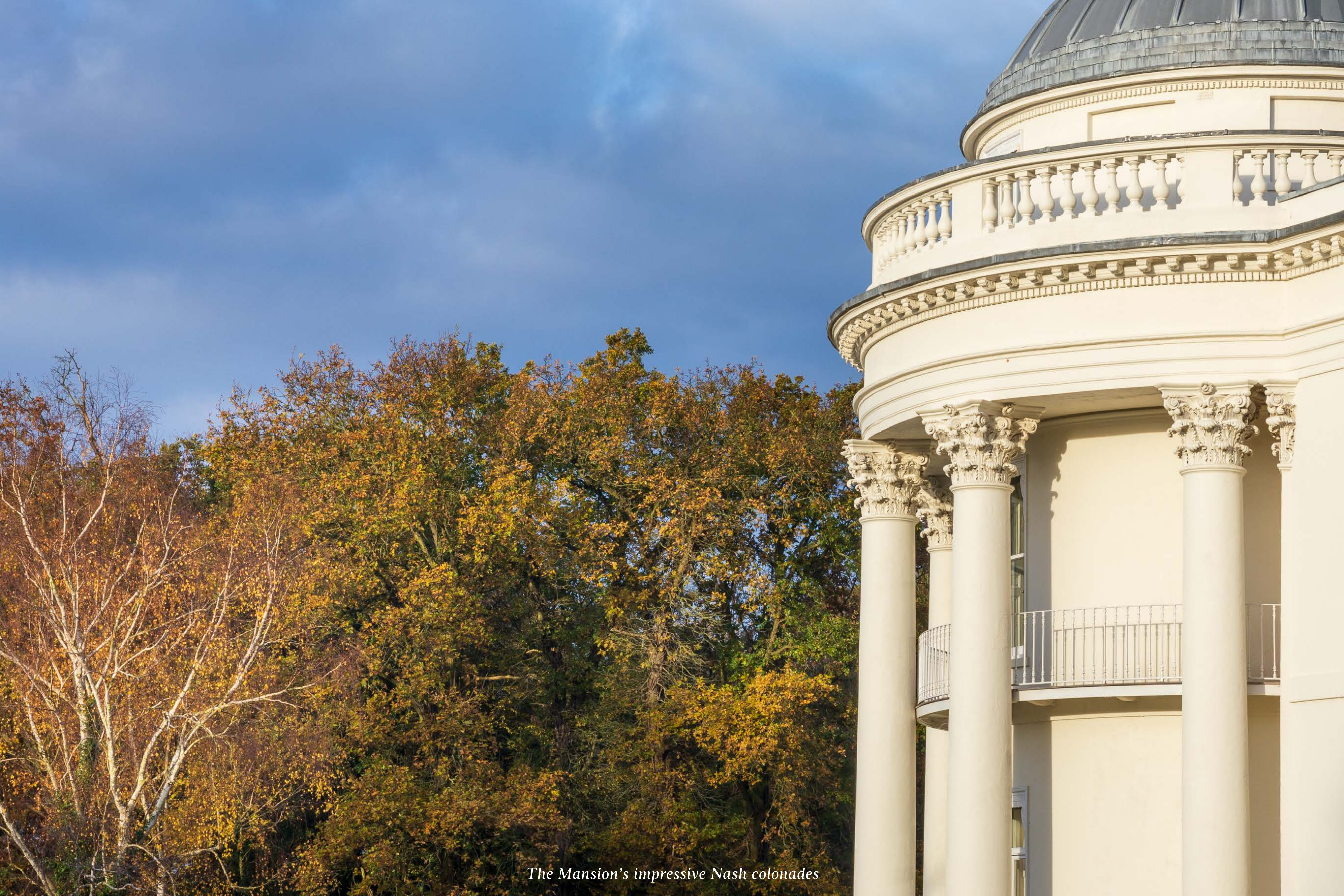
The Mansion's impressive Nash colonades