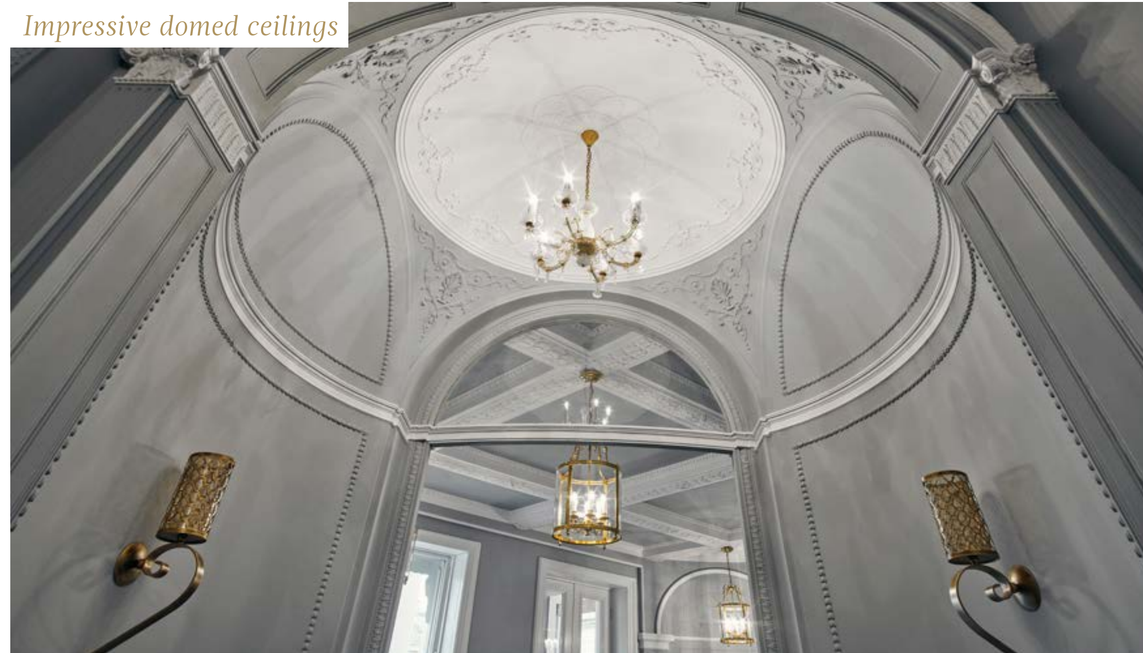
Impressive domed ceilings