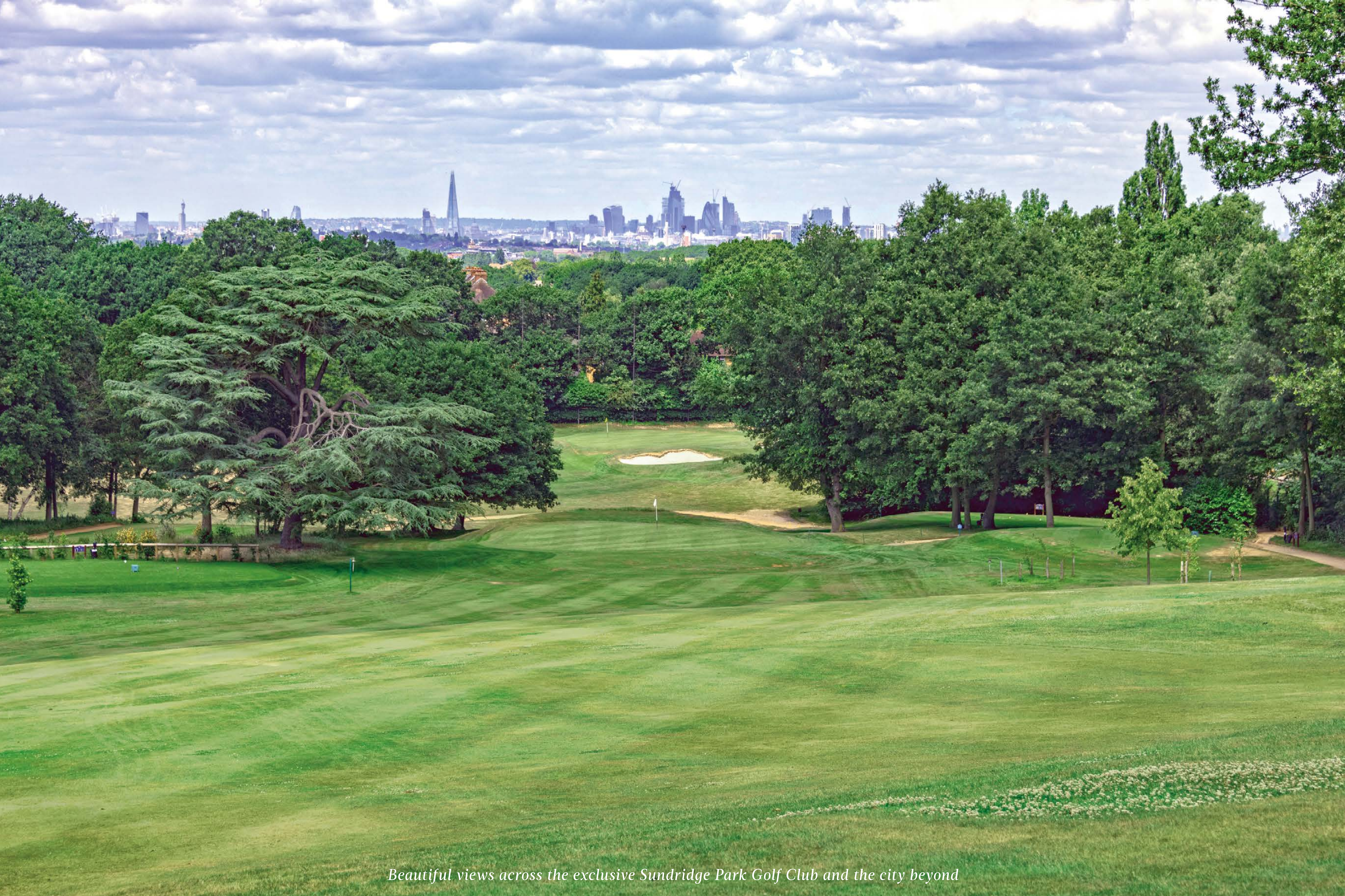
Beautiful views across the exclusive Sundridge Park Golf Club and the city beyond