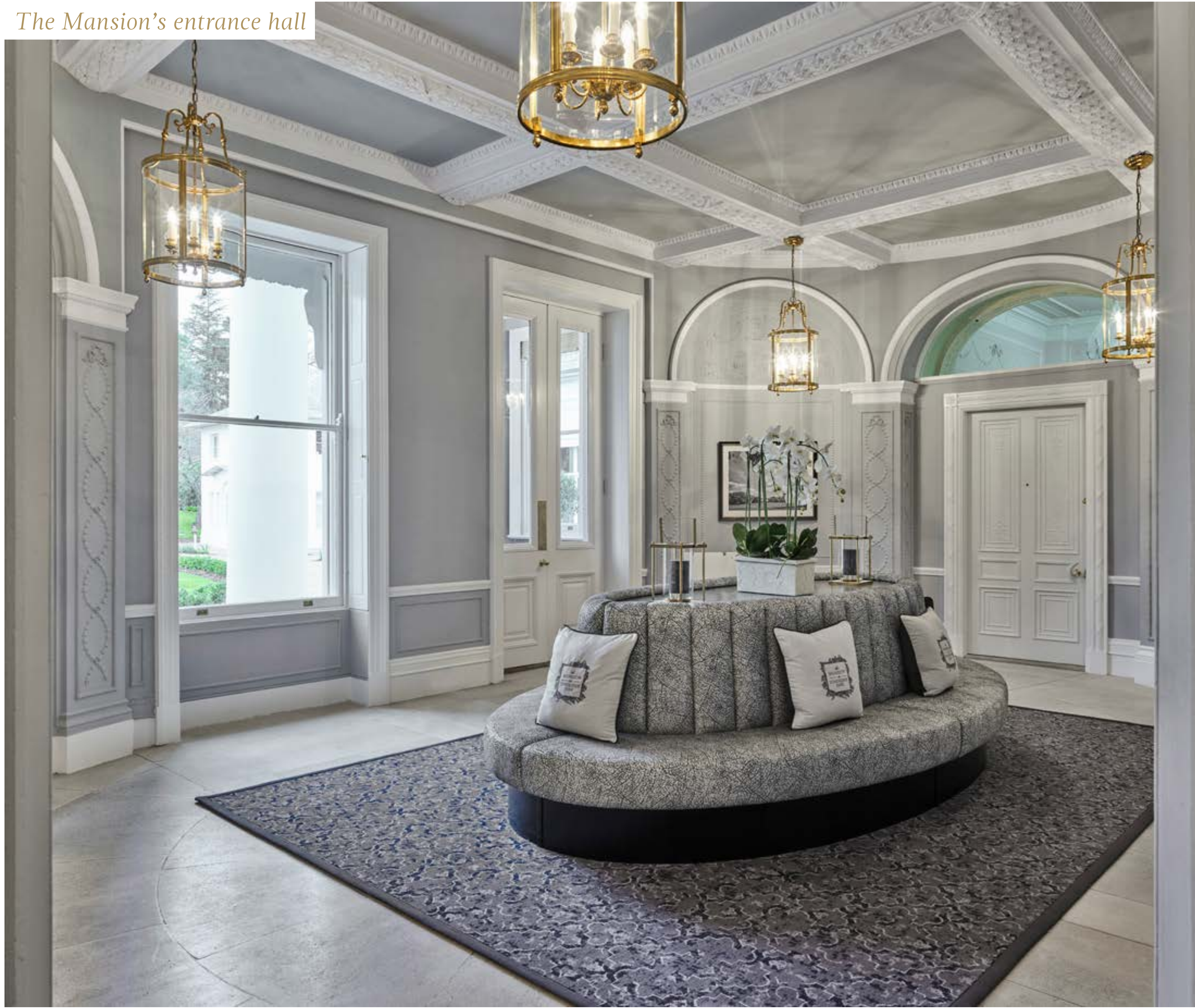
The Mansion's entrance hall