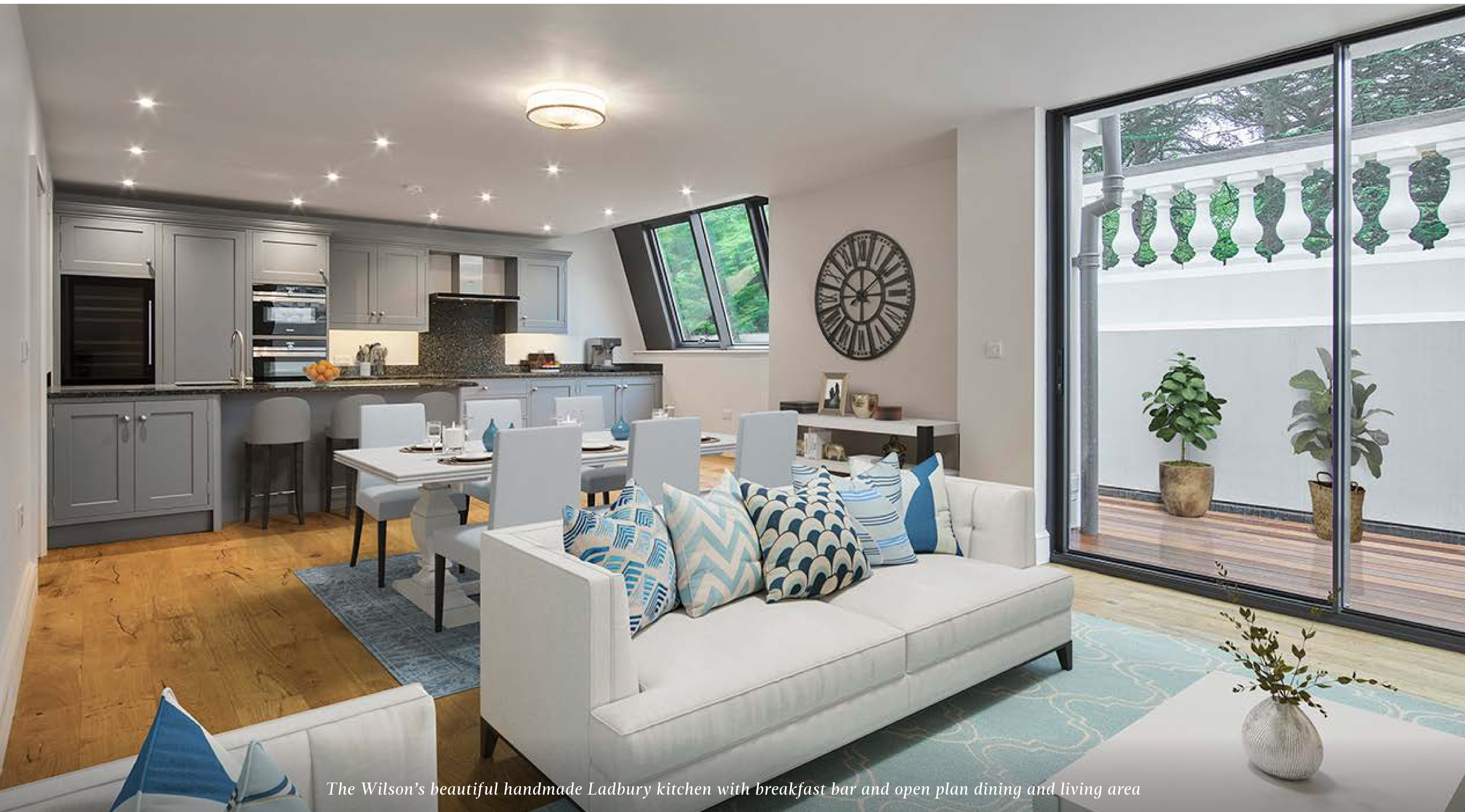
The Wilson's beautiful handmade Ladbury kitchen with breakfast bar and open plan dining and living area