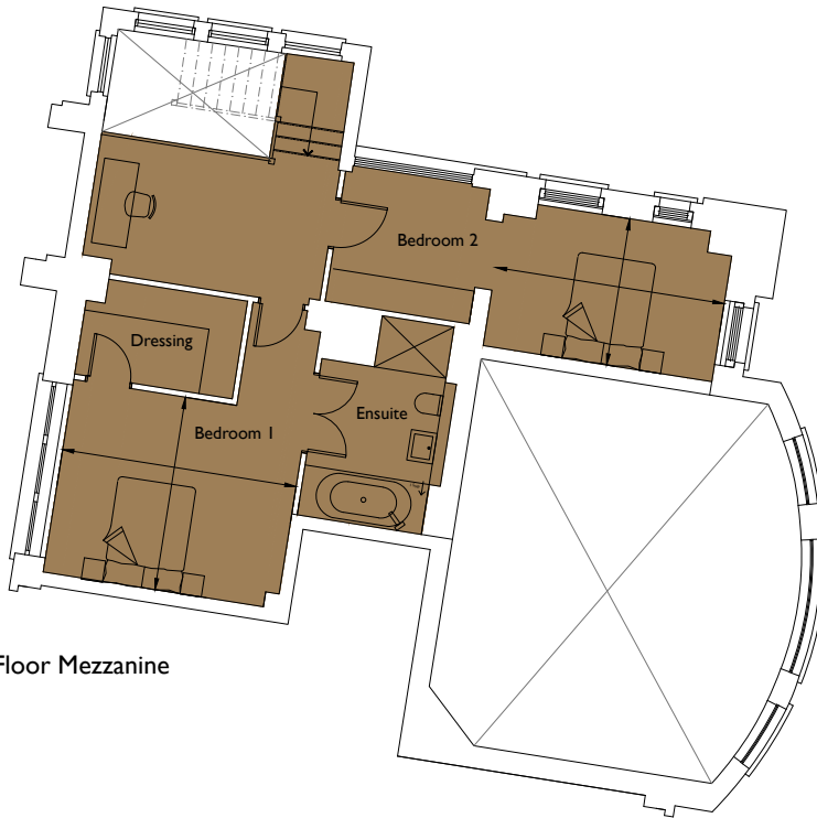
Second Floor Mezzanine