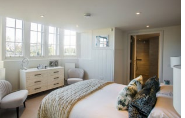
Photography shown may be of similar apartments at Donaldson's and is indicative only