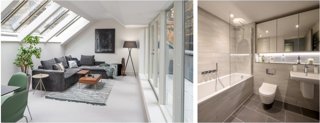
Photography shown may be of similar apartments at Donaldson's and is indicative only