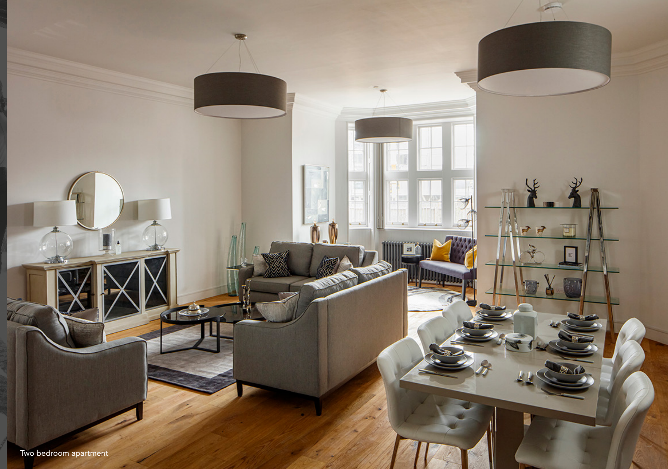
Two bedroom apartment

The information in this document is intended as a guide only and is subject to change without prior notice. Accordingly, due to the City & Country policy of continual improvement, the finished product may vary from the information provided and City & Country reserves the right to amend the specification. Photography shown may be of similar apartments at Donaldson's and is indicative only. All dimensions stated are approximate only with maximum dimensions and may alter through the construction phase and with interior finishes. You are therefore advised not to order any carpets, appliances or other goods which depend upon accurate dimensions before carrying out a check measure within your reserved property.